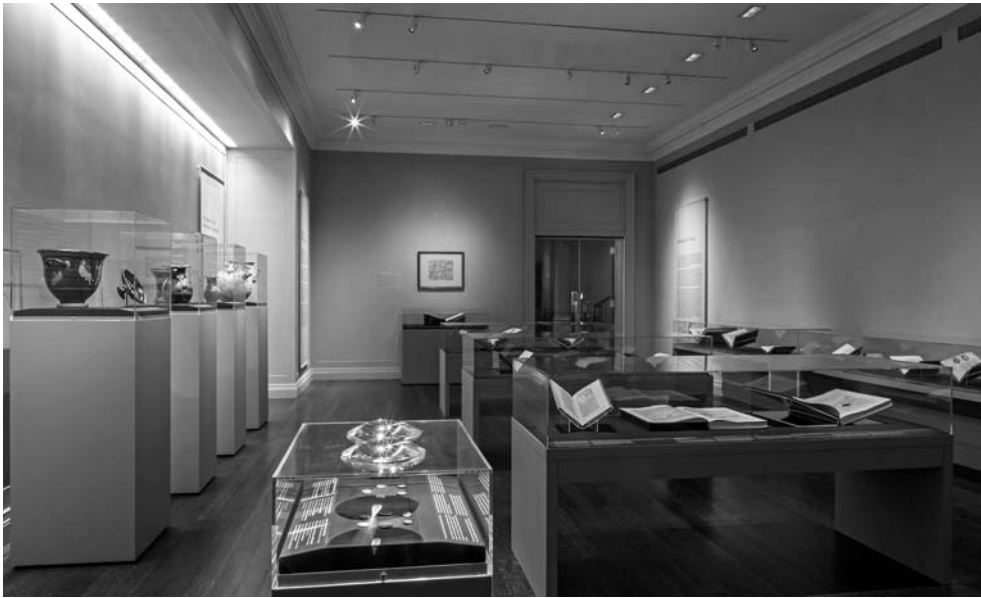
Fig. 1: Overview of the exhibition in Gallery Two.