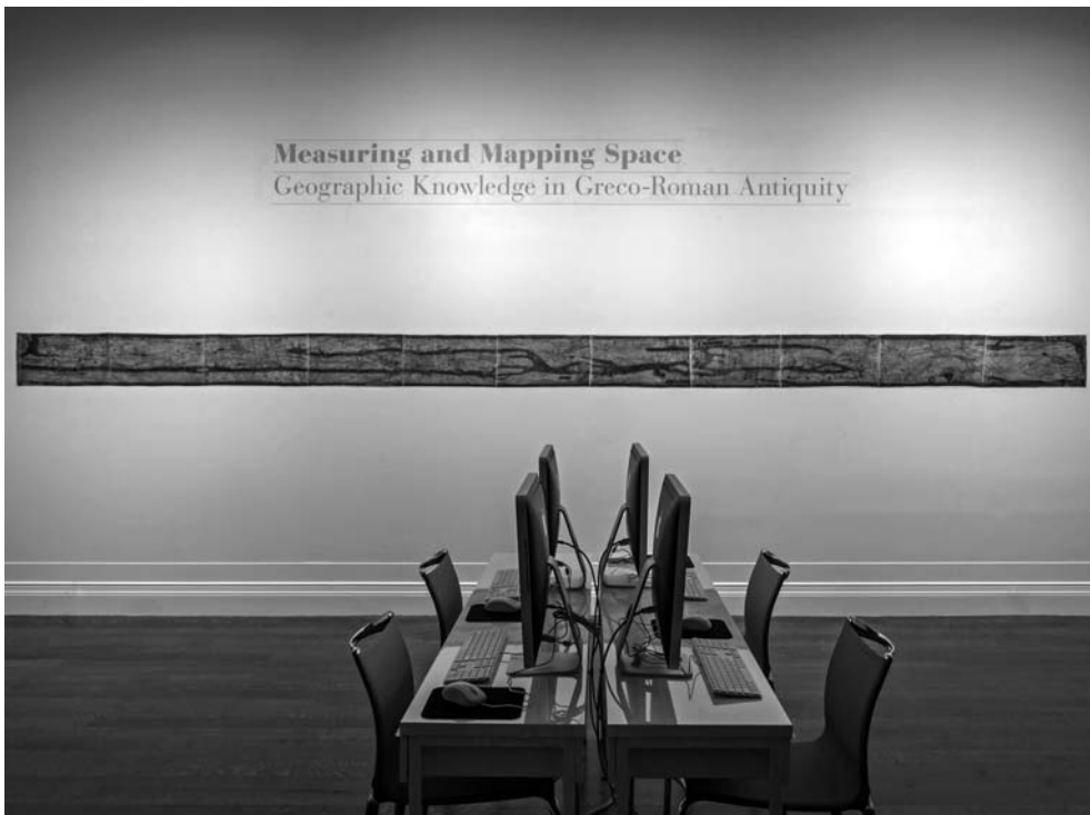
Fig. 2: Gallery One: the computers' installation. In the background, the photo-mural of the Peutinger Map.